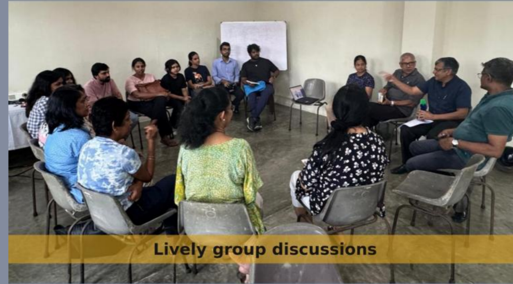
Lively group discussions