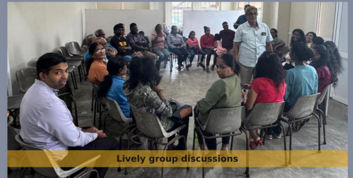
Lively group discussions