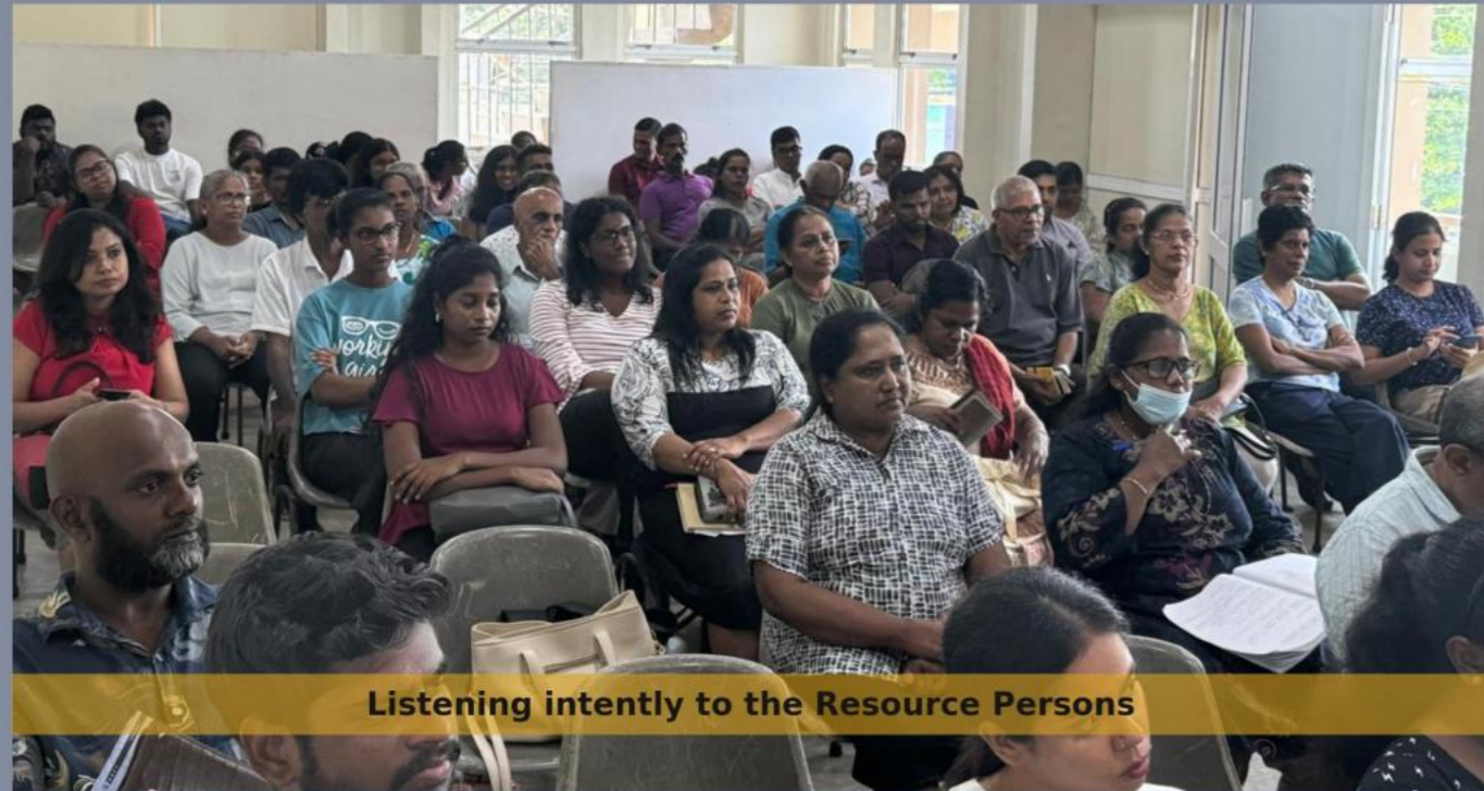
Listening intently to the Resource Persons