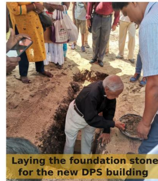
Laying the foundation stone for the new DPS building

It is with profound sadness that we inform you of the death of our beloved Rev Kingsley Perera (Pastor of CGBC from 1988 to 1995) on 28th September 2024.