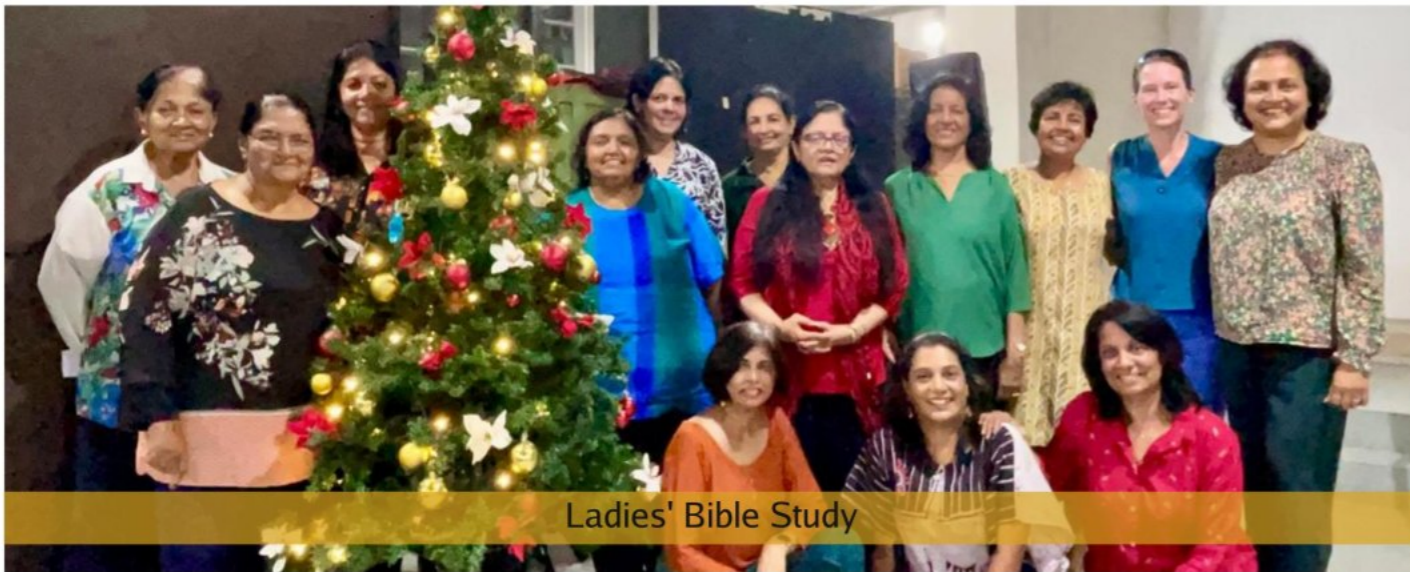
Ladies' Bible Study